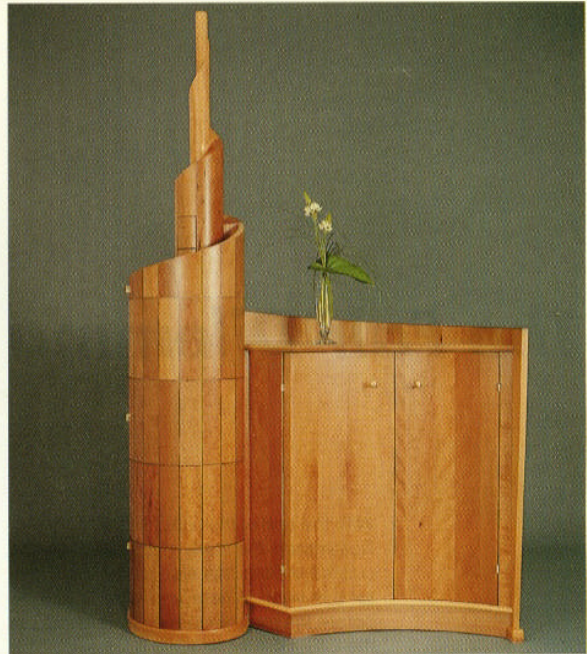
Spiral chest of drawers (1991) pear incrustated with walnut