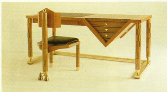
Desk with chair (1988) pear incrustated with walnut

Each "Art Incrusta" item is unique, the result of days of manual work. Inquiries from far and wide (including Japan and America) ensure that none of these items remain on the shelves for very long! "I am convinced," says Zuchi, "that durable, high-quality products are important from an ecological point of view. Those of us who work with natural resources must be aware of our responsibility."